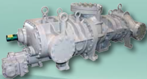
COMPOUND COMPRESSOR (UD & SCV SERIES)