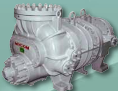
SINGLE-STAGE COMPRESSOR (UD & SCV SERIES)